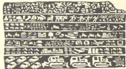
The Representation and Domination of Nature volume 3, 1991

A JOURNAL OF CRITICAL ENVIRONMENTAL STUDIES