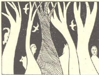
Nature, Culture, Self

A JOURNAL OF CRITICAL ENVIRONMENTAL STUDIES