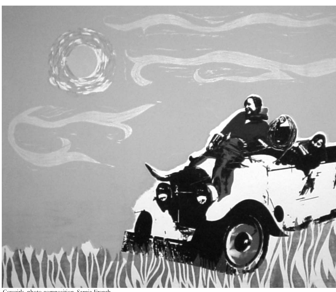
Cowgirls, photo composition, Sarnia French